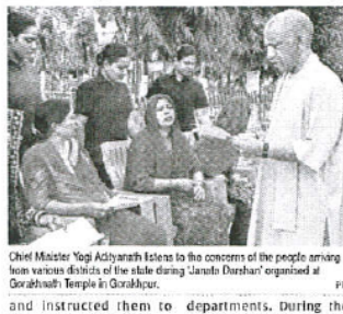
Chief Minister Yogi Adityanath listens to his concerns of the people arriving from various districts of the state during 'Janata Darshan' organised at Gorakhnath Temple in Gorakhpur.

At the Janata Darshan programme held outside the Mahant Digvijaynath Smriti Bhawan at Gorakhnath temple, the chief minister met around 150 people and listened to their problems. He forwarded their applications to the concerned officials