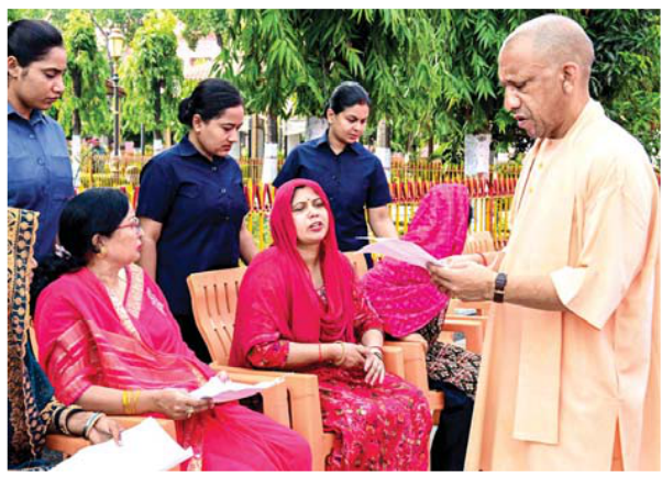
Chief Minister Yogi Adityanath listens to the concerns of the people arriving from various districts of the state during 'Janata Darshan' organised at Gorakhnath Temple in Gorakhpur.

At the Janata Darshan programme held outside the Mahant Digvijaynath Smriti Bhavan at Gorakhnath temple, the chief minister met around 150 people and listened to their problems. He forwarded their applications to the concerned officials