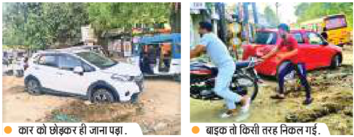
● कार को छोड़कर ही जाना पड़ा.